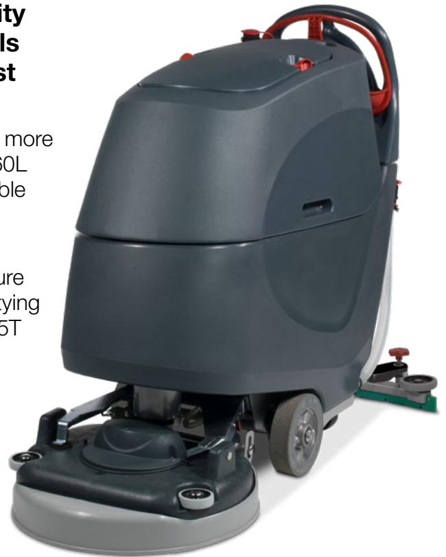
Replacement Blade Set