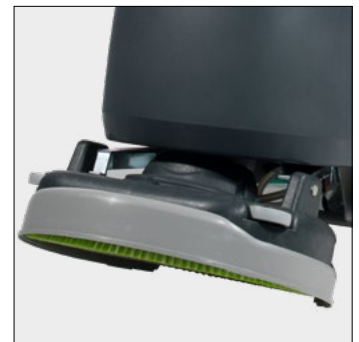
Tilting Brush Deck