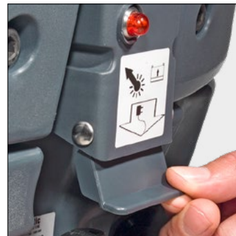
On-board Charging Station