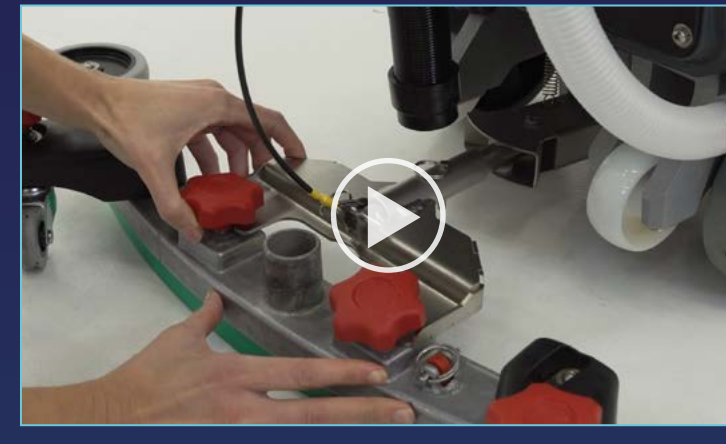
Quick Start Videos