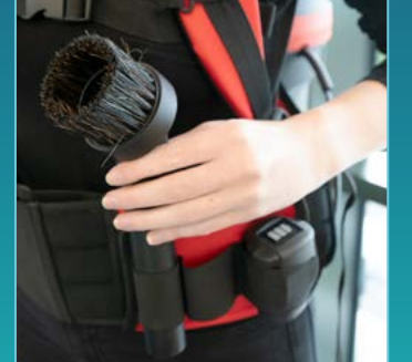
Waisthelt Tool Storage