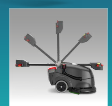
Folding Handle for Compact Storage