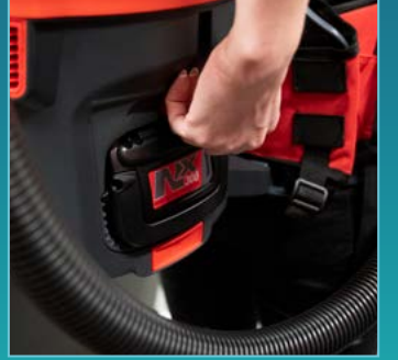
Easy Battery Change