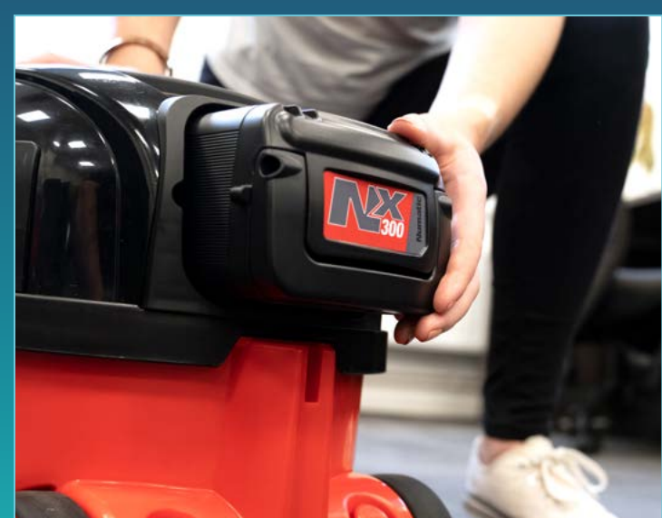
Easy Battery Chang

Large rear wheels, telescopic pull handle and lift-off storage caddy.