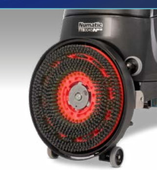
Tilting Deck for Easy Brush Change and Storage