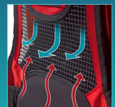
Breathable Mech Panel