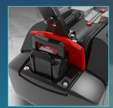
Easy Battery Change