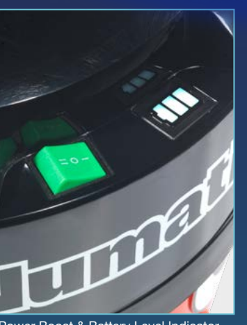
Power Boost & Battery Level Indicator