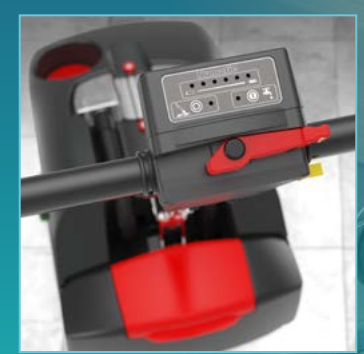
Simple Soft-touch Control