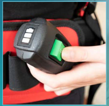
ntegrated Hand Control