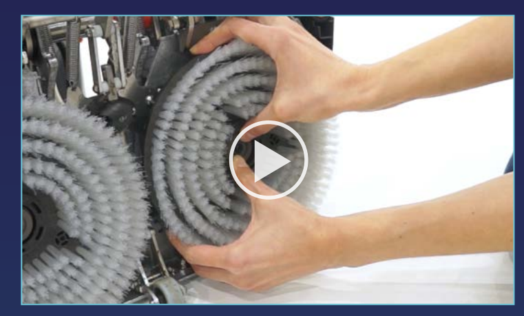
Troubleshooting and Maintenance Videos