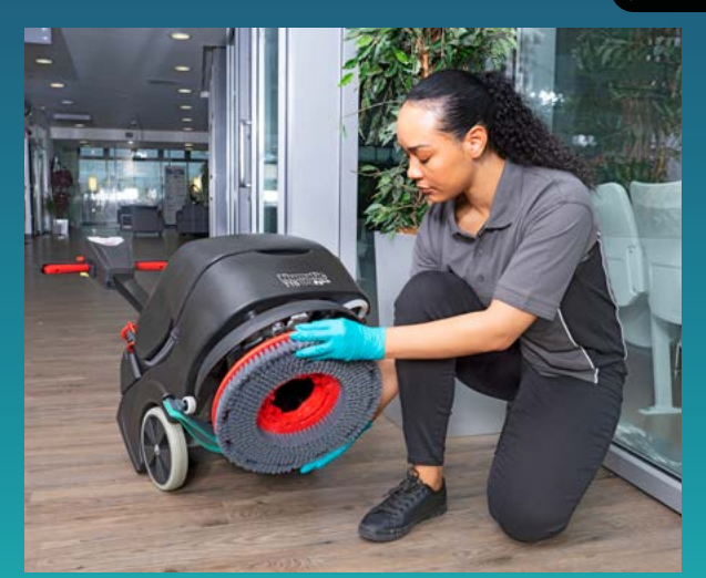
Simple Brush / Pad Change